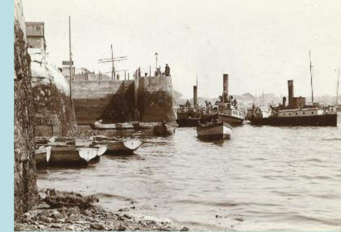
Ferry boats and steamers alongside Mutton Cove pier, c.1900