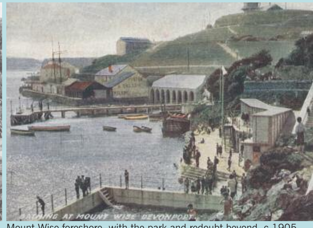
Mount Wise foreshore, with the park and redoubt beyond, c.1909 Private Collection