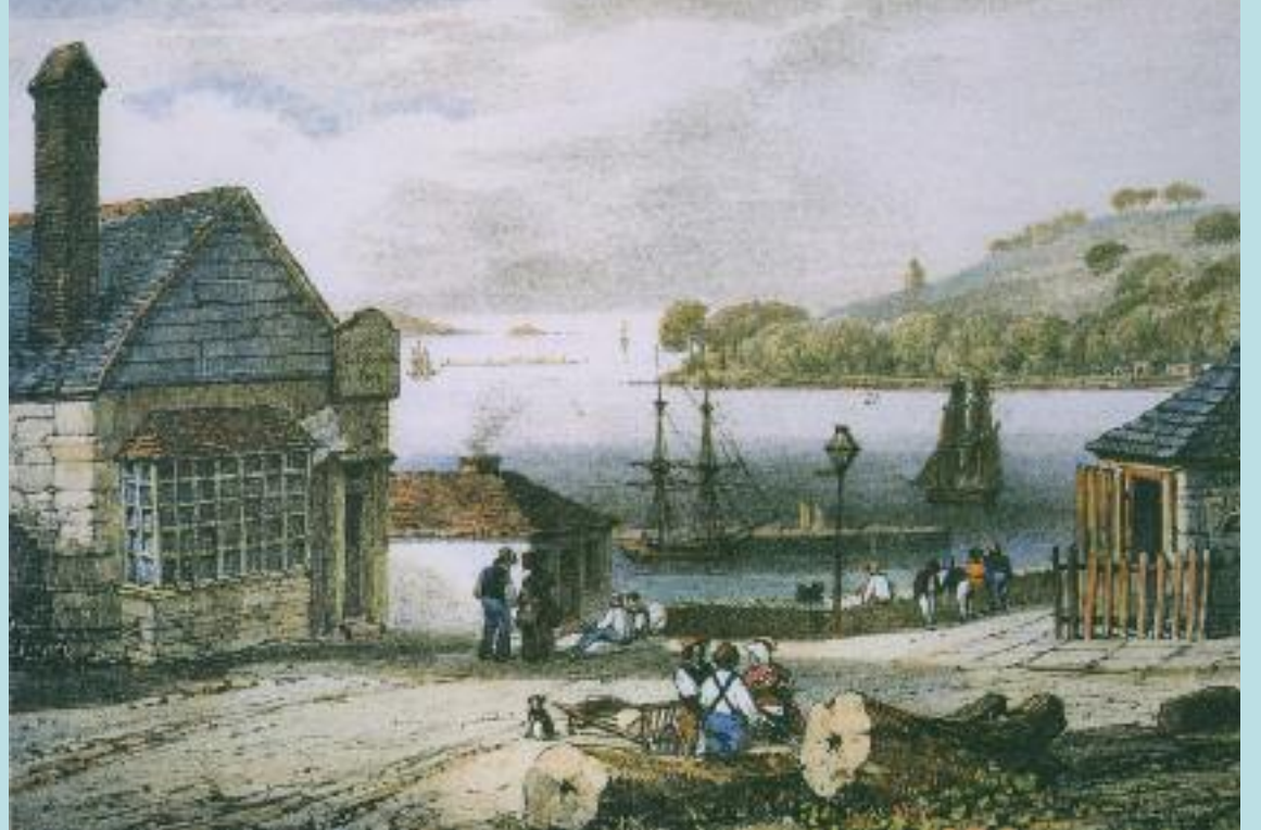
Mutton Cove and view across the Tamar, c.1830

When leaving Mutton Cove for James Street, make sure to look out for the entrance arch to the Royal Laboratory, once home to a Napoleonic gunpowder works, and the old cannon bollard nearby.